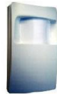
GalleryMaster also includes a wire free PIR sensor (battery life 3 years)

Other sensors include Flood Early Warning, InfraRed Beam (Internal and External), BarrierPIR, Temperature and humidity probes. For more detail on the GalleryMaster Sensors Click here