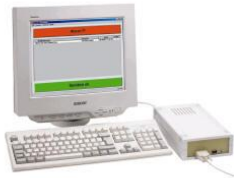
The PC Software is extremely easy to use