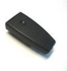
The personal/attack alarm offers two modes of signalling