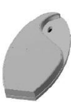
The ShockSensor is adjustable sensitivity (another option can also be triggered by a magnet).