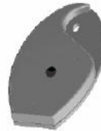
The Non Contact (InfraRed) Sensor does not need to make contact with the exhibit to be effective