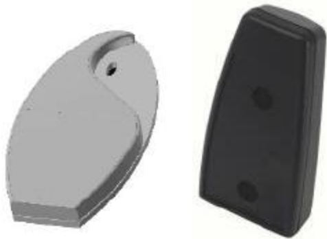
GalleryMaster works with a wide variety of sensor technologies

NOW: Wire free signal repeaters plus environmental monitoring capability.