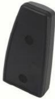
The UltraSound Sensor is for enclosed spaces like Display Cases and small rooms