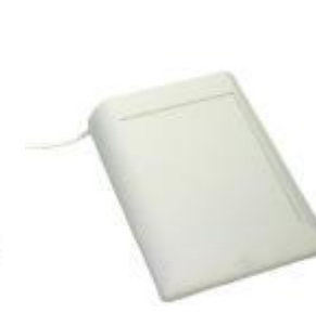
Alarm repeater unit

To pass on alarm and OK signals from many sensors. Contains 1 output relay.