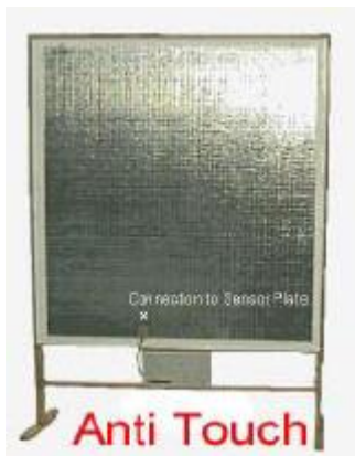
ATS AntiTouch sensors can integrate with GalleryMaster or stand alone