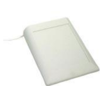
Alarm receiver unit

Four Software licence levels: 0 -10 detectors, 11 - 50 detectors, >50 detectors, > 500 detectors