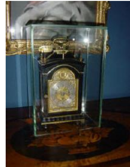
Clock protected by ShockSensor