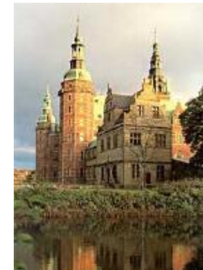
The first installation in 1999 at the Royal Palace in Denmark

The GalleryMaster™ system utilizes receivers and repeaters normally spaced every 75 to 100m through the museum. Receivers are simply wired in a long line (the cable carries the power as well as the communications) back to the PC. Repeaters are separately powered (7 - 24vdc) and allow wire free communication in areas which are difficult to cable. The Interface (Control) box is normally be located in the security control room or on the reception desk. The software runs on a PC or network (windows platform) and allows the security manager (password controlled) to designate a name and location to each sensor. On alarm this information immediately appears on the PC screen. Also communicated are sensor signal faults (low battery), jamming and sensor and receiver signal strength.